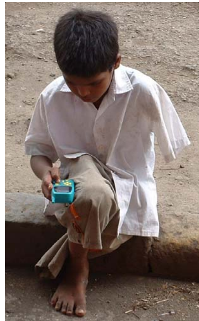
Among the fundamental rights of children is the right to play

A Research project on working children in Mumbai was undertaken by the OPCR Mumbai in collaboration with the National Social Service Unit