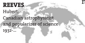
REEVES Hubert: Canadian astrophysicist and popularizer of science 1932-...

We borrow this title from Hubert REEVES 's book, to demonstrate the unconscious misappropriation of resources. The drive to productivity is wasting the Earth's resources and totally ignoring the right to freedom of millions of children. Since World War II, one dominant thought prevails: making our