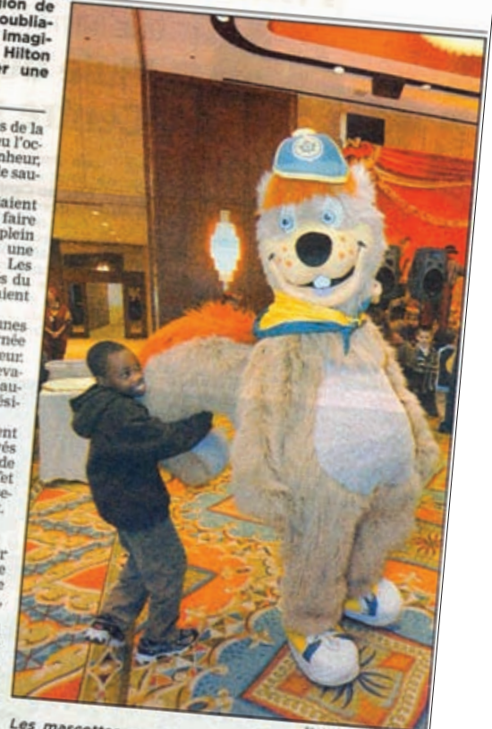
Les mascottes ont bien amusé les jeunes qui étaient tout sourire.

L'an dernier, il y a un jeune garçon qui est venu me demander s'il pouvait se servir une deuxième fois. Il mettait de la nourriture dans ses poches pour son frère. C'est là que ça fait mal au cœur. On se rend compte que, s'ils prennent la peine de demander la permission, c'est parce qu'il n'y a pas d'abondance à la maison », a partagé une employée de l'hôtel.